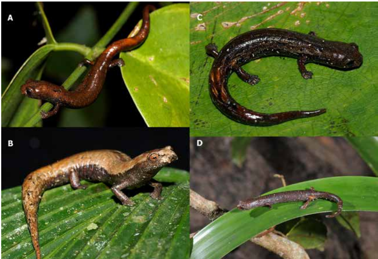
Fig. 1. Bolitoglossa leandrae : subadult male CVUNET 645 (A) and adult female CVUNET 644 (B), both from Quebrada La Espuma, Río Frío, Táchira state, Venezuela. Bolitoglossa tamaense : adult females CVUNET 615 (C) and CVUNET 626 (D), both from Matamula, between Bramón and Delicias, Táchira state, Venezuela.

The Valle del Río Doradas is an important area for Orinoquian and Upper Amazonian herpetofauna (contrasting with the surrounding typical Llanos and Andes elements), as demonstrated by Barrio-Amorós and colleagues for other amphibian species like Hypsiboas lanciformis Cope 1871, H. boans (Linnaeus 1758), Scinax wandae (Pyburn and Fouquette 1971), Lithodytes line-